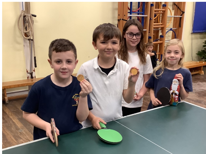
Table Tennis vs Blackminster. Well done to both the boys' and girls' teams.